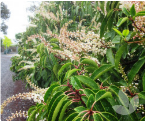
Prunus lusitanica PORTUGUESE LAUREL TREE

This is a great tree for a broad evergreen screen. It has a wonderful weeping habit with narrow leaves and an attractive pinkish-green tone to new foliage. Our selection is bushy to the ground, making the instant hedge a reality. Talk to us now for material from under 1 metre to upwards of 4 metres tall depending on your needs.