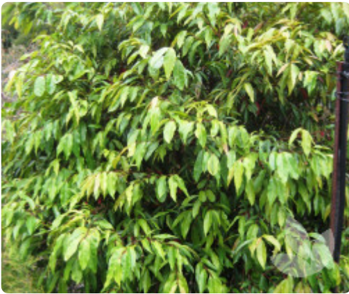
Waterhousea floribunda 'ST1' Whisper (syn. Syzygium) WHISPER WEEPING LILLY PILLY TREE

These selections are perfect for ultimate coverage. Trees are full and fat and dressed to the ground.