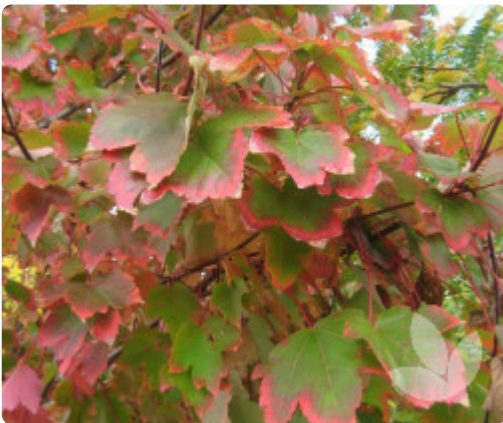
Acer rubrum 'Autumn Red'

This deciduous tree has small oval shaped green leaves that turn a stunning reddish/orange in the autumn. The most striking part of the tree is its beautiful coral red crinkled flowers that are borne in late summer. They flower heads form on new growth and are encouraged by winter pruning. The smooth bark is beige coloured with red-brown streaks.