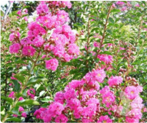
Lagerstroemia indica x fauriei 'Tuscarora'

Don't be afraid to use deciduous selections around pools. Mixed with evergreen, they often add a splash of bold colour and year-round interest.