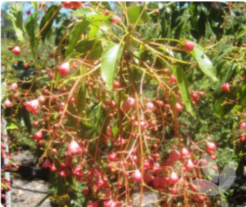
Brachychiton populneus x acerifolius 'Bella Pink' BELLA PINK BRACHYCHITON TREE

Striking a balance between community expectations around fire prevention and encouraging increased canopy cover along streets is tricky. What should you consider? And what selections are available?