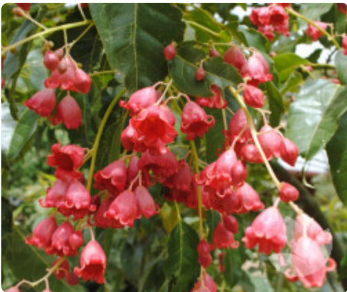
Brachychiton populneus x acerifolius 'Jerilderie Red' JERILDERIE RED BRACHYCHITON TREE

Grows 8m x 7m. A new grafted selection. Small to medium-sized tree, grafted for compactness. Great for urban situations including streetscapes. Makes a reliable shade tree.