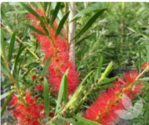
Callistemon viminalis 'Kings Park Special' KINGS PARK BOTTLEBRUSH TREE

Grows 8m x 7m. A new grafted selection with a bloated trunk and stunning flowers in summer. This is another tree that would make a good street tree and distinctive signature statement. It is a reliable selection for shade.